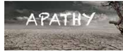
A CARELESS APATHY - V21-26