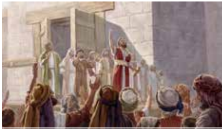
A COMMUNICATED ACTION - V17-20