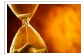
THE ADMISSION - V23-24