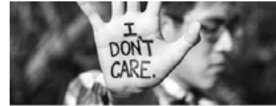
THE ATTITUDE - V21-22