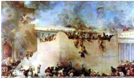
THE APPLICATION - V12-16