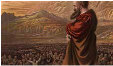
THE ACT - V17-18