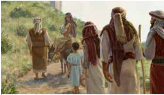
THE ACCUSATION - V26-27