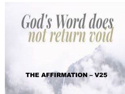
THE AFFIRMATION - V25