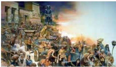
THE APPOINTMENT - V19-20