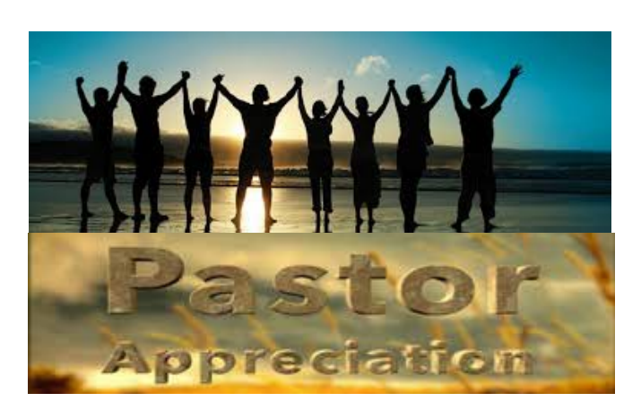
A CO-OPERATING APPROVAL – V13B