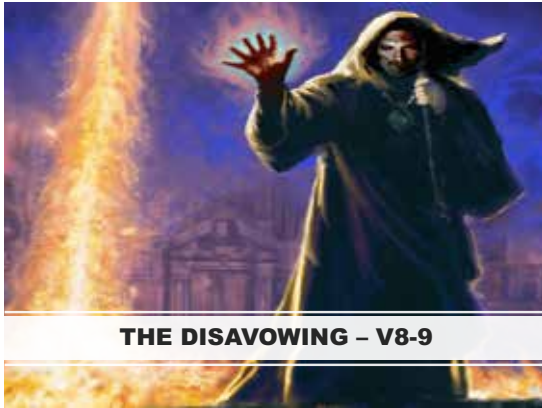
THE DISAVOWING - V8-9