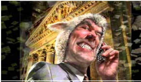
THE DECEIVER'S UNMASKED - V1-7

Genesis 8:22 "As long as the earth endures, seedtime and harvest, cold and heat, summer and winter, day and night will never cease."