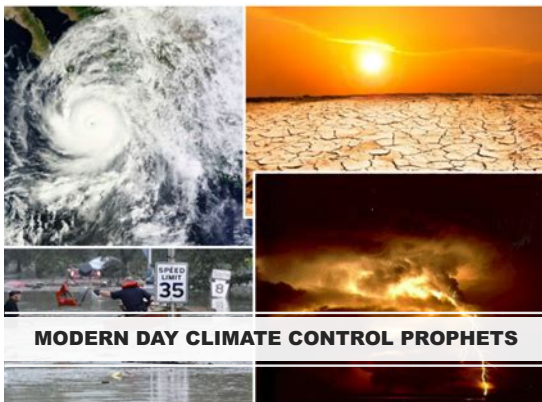
MODERN DAY CLIMATE CONTROL PROPHETS