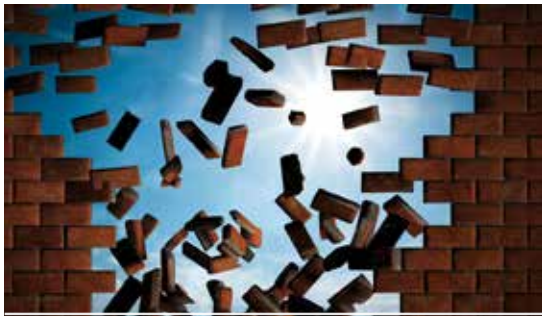
THE DISCLOSURE - V10-12