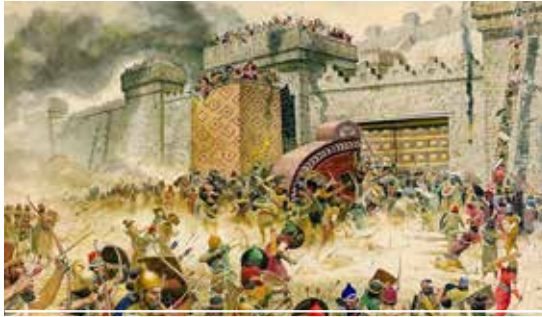
THE DESTRUCTION UNLEASHED - V8-16