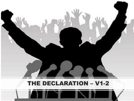
THE DECLARATION - V1-2

Jeremiah 5:22 - 'Do you not fear Me?' declares the LORD 'Do you not tremble in My presence? For I have placed the sand as a boundary for the sea, an eternal decree, so it cannot cross over it. Though the waves toss, yet they cannot prevail; Though they roar, yet they cannot cross over it.