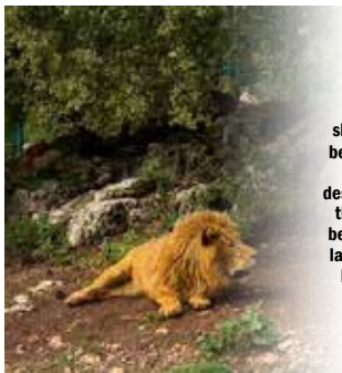
JORDAN - V3

Cry, pine trees, because the cedar has fallen, because the tall trees are ruined. Cry, oaks in Bashan, because the mighty forest has been cut down.