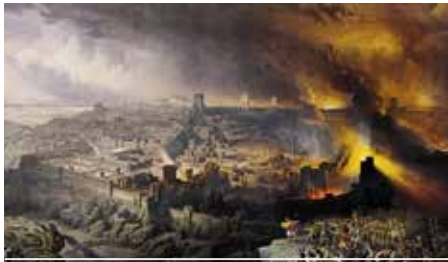
THE PASTURES RAVAGED - V1-3