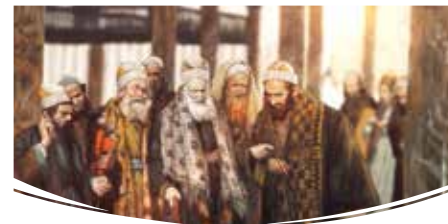
THE REASON - V5

This is what the Lord my God says: "Feed the flock that are about to be killed"