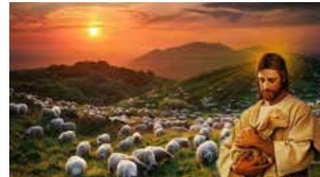
THE ROLE - V4

This is what the Lord my God says: "Feed the flock that are about to be killed"