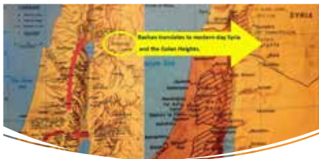
BASHAN - V2

Cry, pine trees, because the cedar has fallen, because the tall trees are ruined. Cry, oaks in Bashan, because the mighty forest has been cut down.