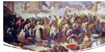
THE REJECTION - V6

Their buyers kill them and are not punished. Those who sell them say, 'Praise the Lord, I am rich.' Even the shepherds don't feel sorry for their sheep.