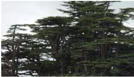
LEBANON - V1 - Lebanon, open your gates so fire may burn your cedar trees.