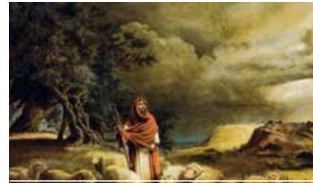
THE PERSONAL REPRESENTATION - V4-10

Listen to the shepherds crying because their rich pastures are destroyed. Listen to the lions roaring because the lovely land of the Jordan River is ruined.