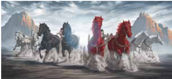
THE COMMAND - V6 - 7

THE CHARACTER - V5 He said, "These are the four spirits of heaven. They have just come from the presence of the Lord of the whole world.