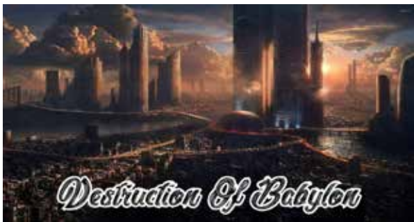
THE CONFIDENCE EXERCISED - V8

The chariot pulled by the black horses will go to the land of the north. The white horses will go to the land of the west, and the spotted horses will go to the land of the south." When the powerful horses went out, they were eager to go through all the earth. So, he said, "Go through all the earth," and they did.