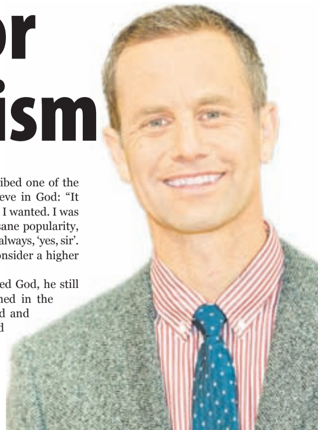
Kirk Cameron says being able to know what and why you believe is critically important.

Kirk began to investigate Christianity and, as a consequence, submitted his life to Christ soon after.