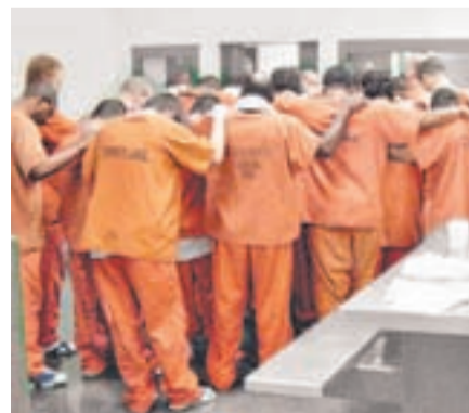
Prisoners praying together.

"I've been in prison eight times since I was 11 years old. I've been locked up or