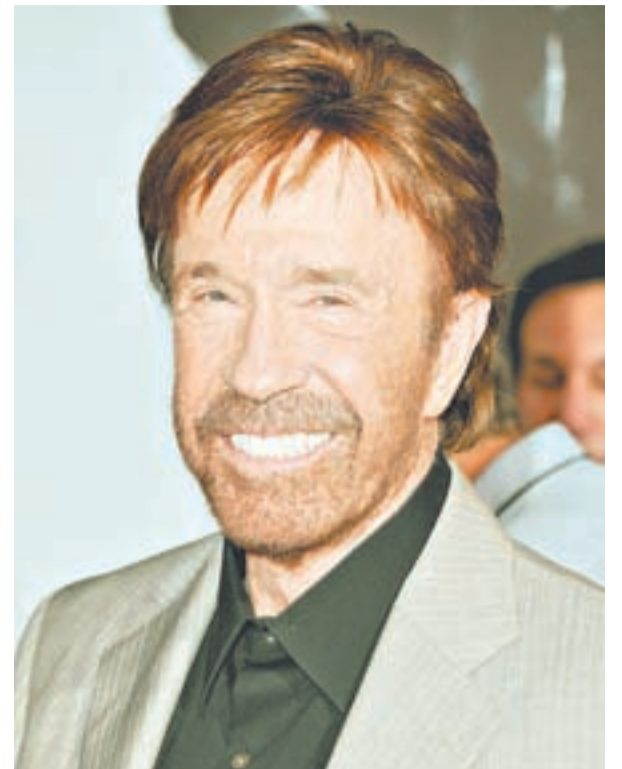
Actor Chuck Norris in Hollywood, California in 2012.

“It’s amazing because people come up to me and say, ‘Chuck, you’re the luckiest guy in the world to be a world karate champion and a movie and TV star.’ When they say this to me, I kind of smile because luck had nothing to do with it; God had everything to do with it.”