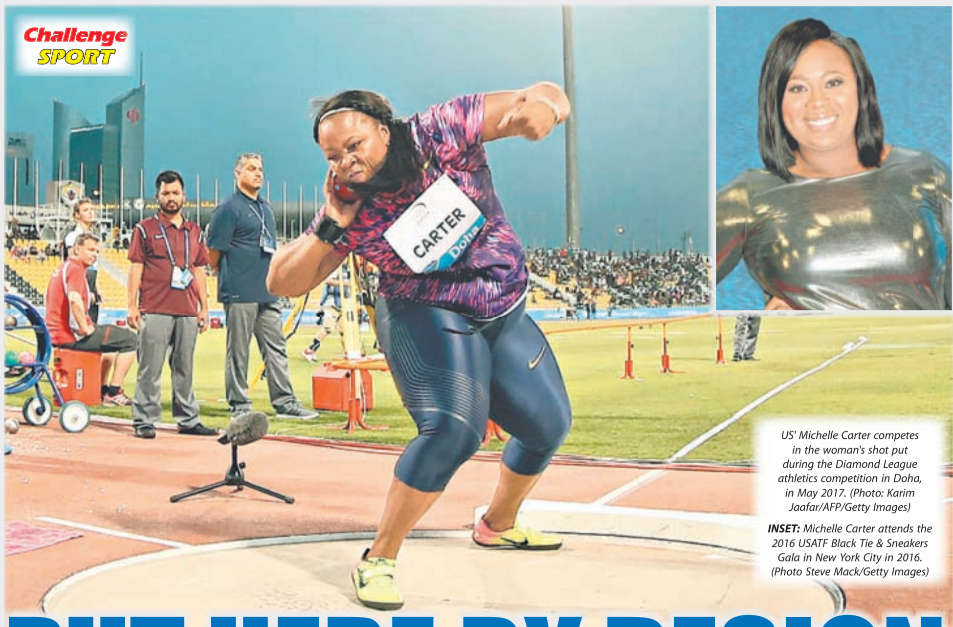
US' Michelle Carter competes in the woman's shot put during the Diamond League athletics competition in Doha, in May 2017.