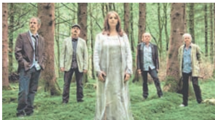
Clannad, left to right: Pól Brennan, Ciarán Brennan, Moya Brennan and their twin uncles, Noel Duggan and Pádraig Duggan.

It has been over 40 years since the young Irish girl set out to earn her title, 'the first lady of Celtic music'. Along the way, she has added others such as 'wife' and 'mother', but the most important one that will last for eternity is 'child of God'. •