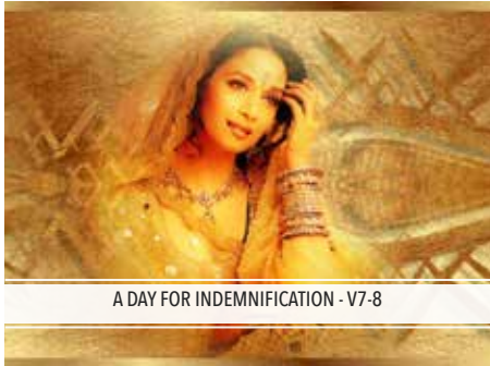
A DAY FOR INDEMNIFICATION - V7-8

THE ADMISSION - V7 King Xerxes answered Queen Esther and Mordecai the Jew, "Because Haman was against the Jewish people, I have given his things to Esther, and my soldiers have hanged him.