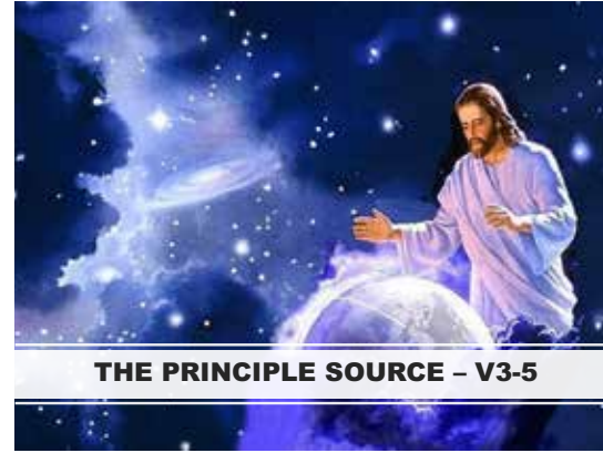
THE PRINCIPLE SOURCE - V3-5