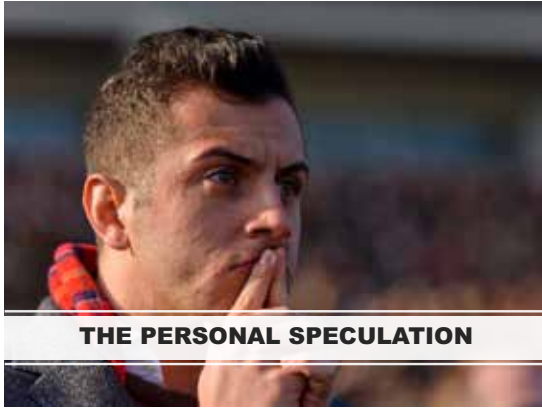
THE PERSONAL SPECULATION