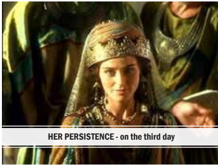
HER PERSISTENCE - on the third day

HER PREPARATION - Esther put on her royal robes and stood in the inner courtyard of the king's palace, facing the King's hall.