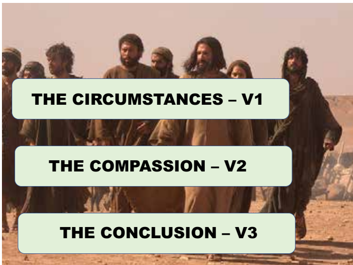
THE CIRCUMSTANCES - V1