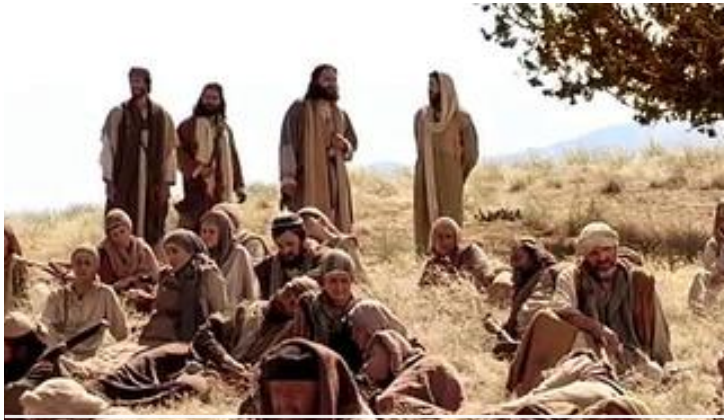
A REASONED MOTIVATION - V1-3