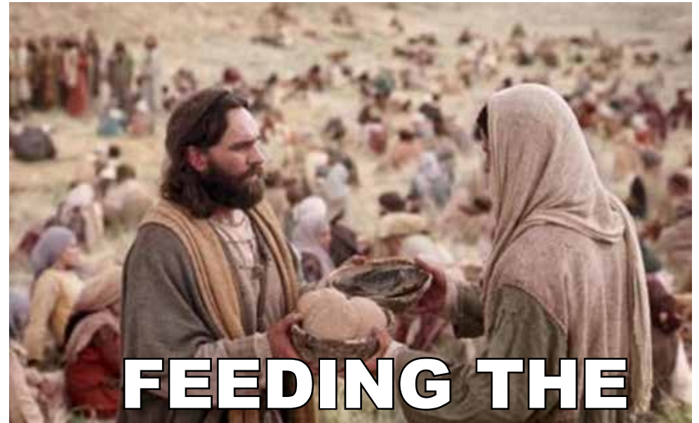
FEEDING THE 4000