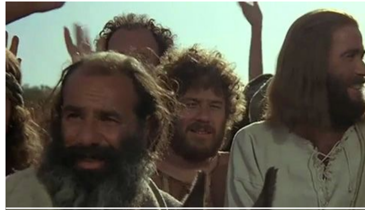
A REACTIVE MOMENT - V4-5