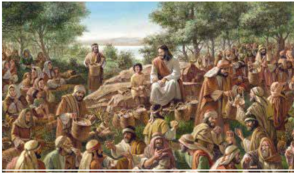
A RESPONSE FROM THE MASTER – V6-9