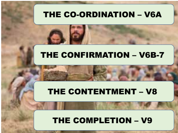
THE CO-ORDINATION – V6A