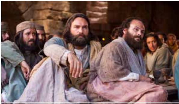
A PREFERRED CORRECTION - V17-21