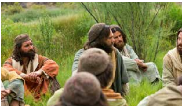
THE DEMONSTRATION - V19-20