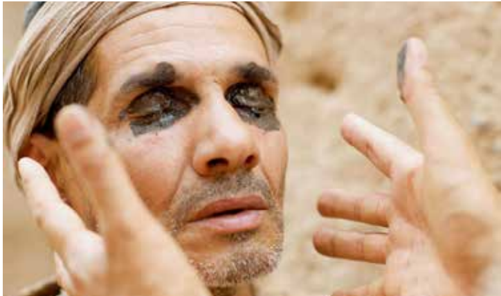
THE DISCUSSION - V23-24