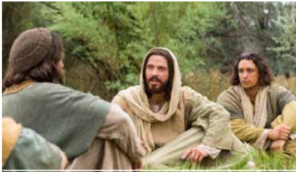
THE DISAPPOINTMENT - V17-18