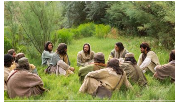
THE DEDUCTION - V21