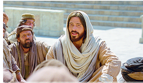
A PERSONAL CHALLENGE - V22-26