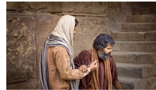
THE DESIRE - V22