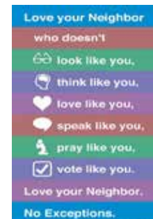
A PERTINENT RELEVANCE - V32-34