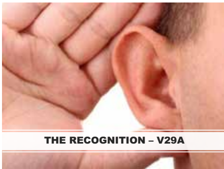
THE RECOGNITION - V29A