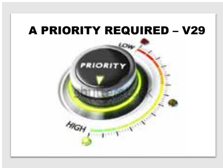
A PRIORITY REQUIRED - V29