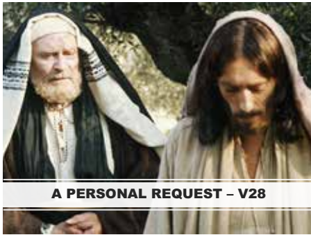
A PERSONAL REQUEST - V28