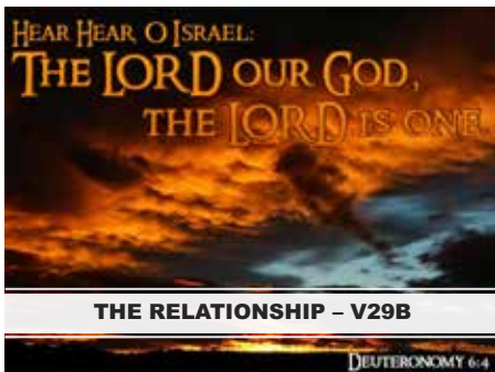
THE RELATIONSHIP - V29B