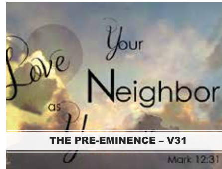
THE PRE-EMINENCE - V31