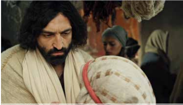
A PERSONAL REQUEST - MARK 7:24-26