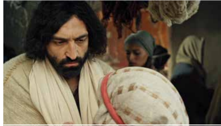
A PERISTENCE DESPITE REJECTION - MARK 7:27-28