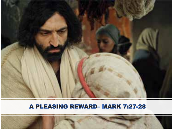
A PLEASING REWARD- MARK 7:27-28