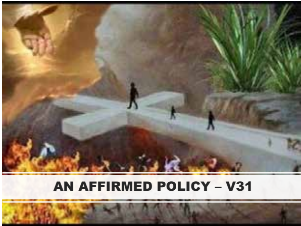
AN AFFIRMED POLICY - V31