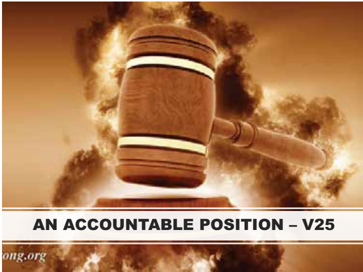
AN ACCOUNTABLE POSITION - V25