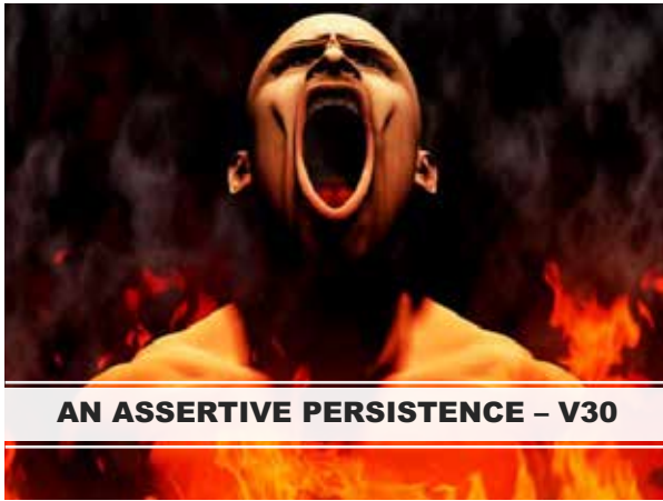
AN ASSERTIVE PERSISTENCE - V30