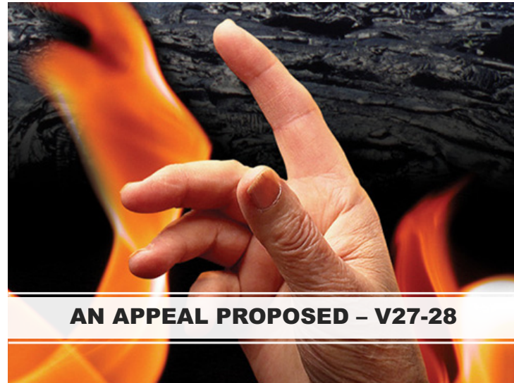
AN APPEAL PROPOSED - V27-28