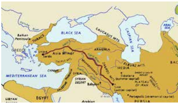
THE AMPLIFICATION - V1 - even from the cities on the seacoast.

And all the great things Xerxes did by his power and strength are written in the record books of the kings of Media and Persia.