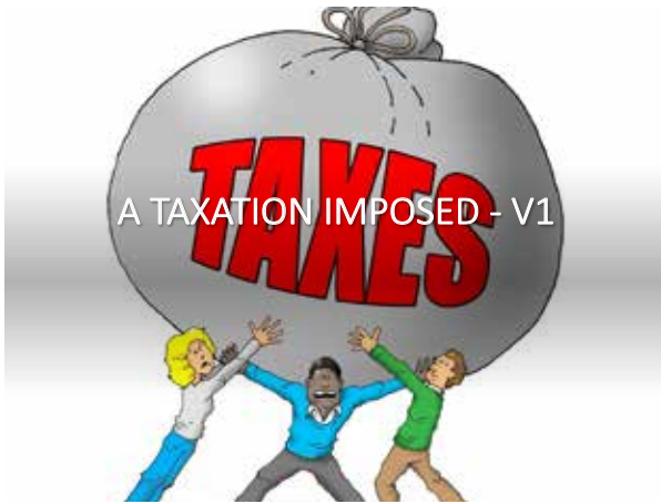
A TAXATION IMPOSED - V1