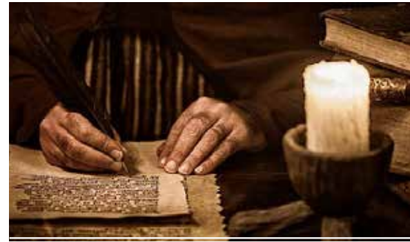
A TESTIMONY INSCRIBED - V2