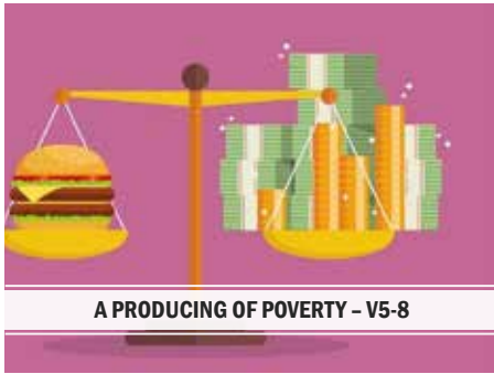
A PRODUCING OF POVERTY - V5-8