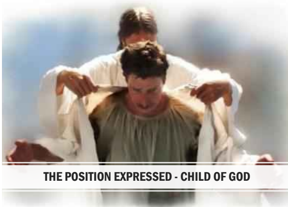
THE POSITION EXPRESSED - CHILD OF GOD