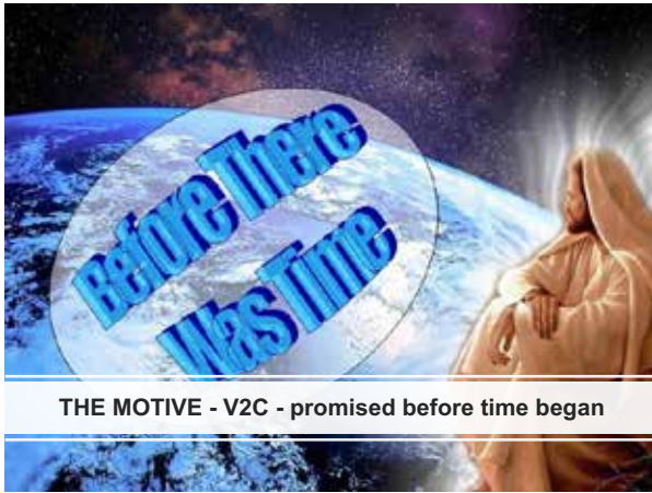
THE MOTIVE - V2C - promised before time began