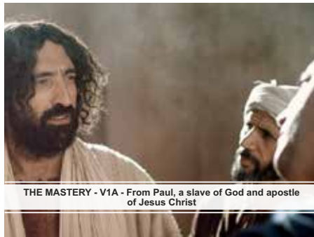
THE MASTERY - V1A - From Paul, a slave of God and apostle of Jesus Christ

THE MISSION - 1B to further the faith of God's chosen ones and the knowledge of the truth