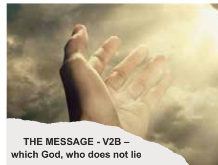
THE MESSAGE - V2B – which God, who does not lie