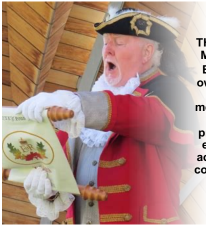
THE PREACHED MESSAGE - V3 But now in his own time he has made his message evident through the preaching I was entrusted with according to the command of God our Saviour.