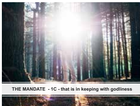
THE MANDATE - 1C - that is in keeping with godliness