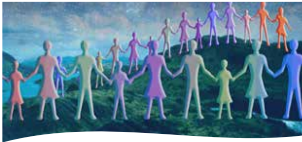
THE PRESENTED MEMBER - V4 To Titus, my genuine son in a common faith. Grace and peace from God the Father and Christ Jesus our Saviour!