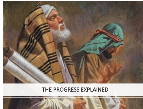
THE PROGRESS EXPLAINED

λέγω γὰρ ὑμῖν ὅτι ἐὰν μὴ περισσεύσῃ ὑμῶν ἡ δικαιοσύνη πλεῖον τῶν γραμματέων καὶ Φαρισαίων, οὐ μὴ εἰσέλθῃτε εἰς τὴν βασιλείαν τῶν οὐρανῶν.