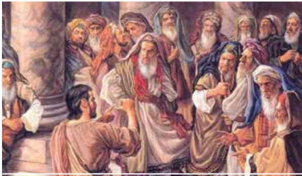
THE PRIDE EXHIBITED