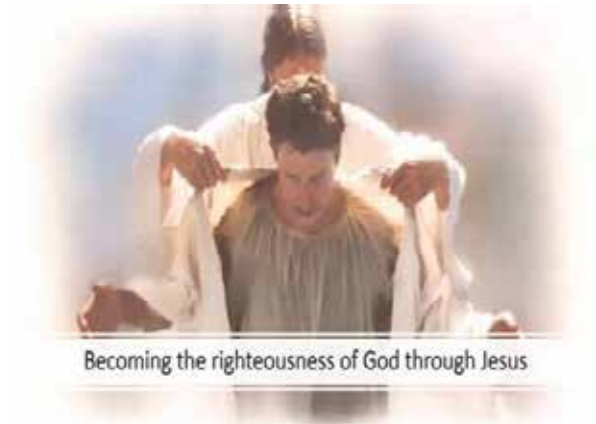
Becoming the righteousness of God through Jesus