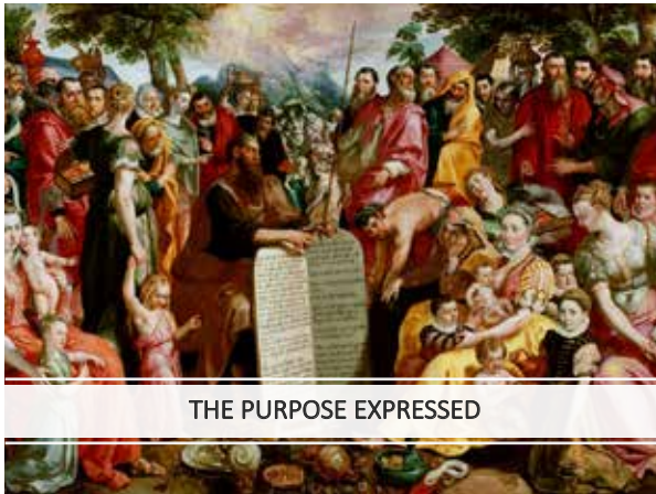
THE PURPOSE EXPRESSED