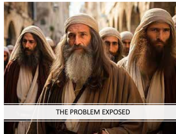
THE PROBLEM EXPOSED