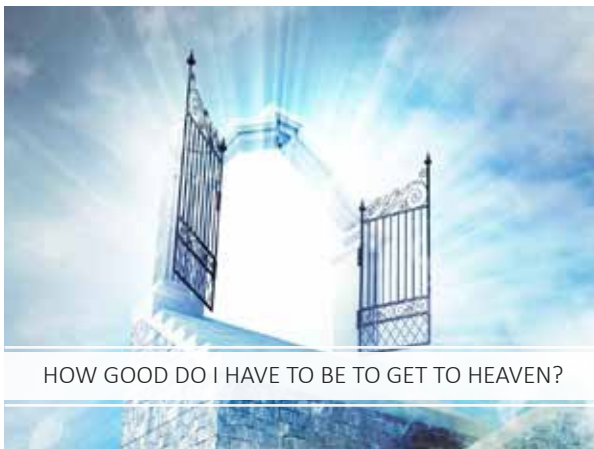
HOW GOOD DO I HAVE TO BE TO GET TO HEAVEN?

Thus they separated themselves not only from the non-Jews--whom they absolutely despised and considered pagan "Gentile dogs"--but they even set themselves above and apart from their own Jewish brethren.