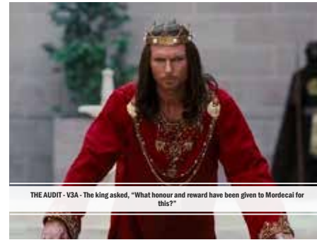
THE AUDIT - V3A - The king asked, "What honour and reward have been given to Mordecai for this?"