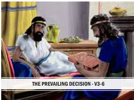
THE PREVAILING DECISION - V3-6