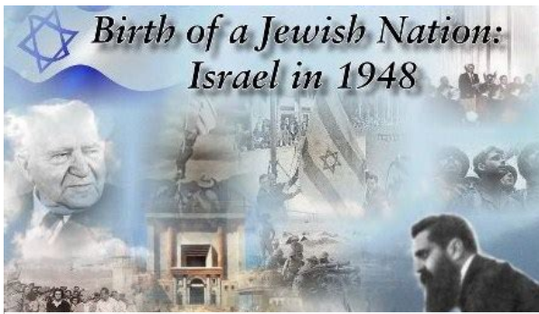
THE CONFIDENCE – V17-18