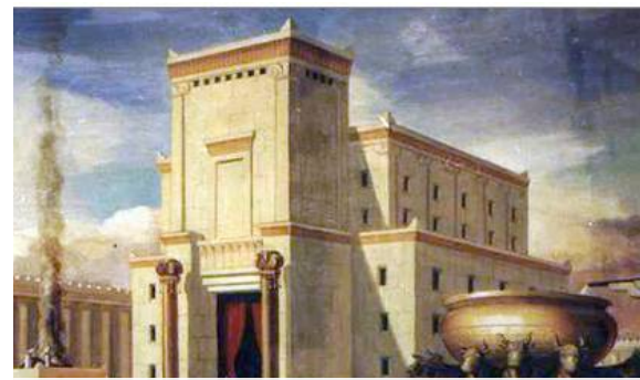
THE PERSONAL ICHABOD – V22-25