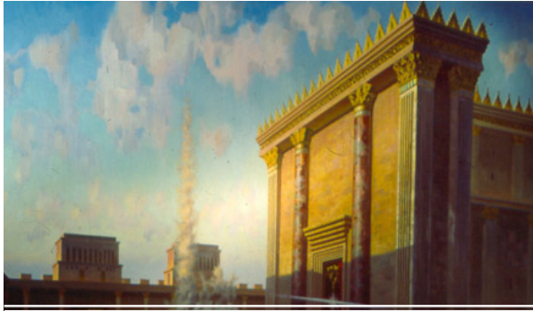
THE CONTROL - V22