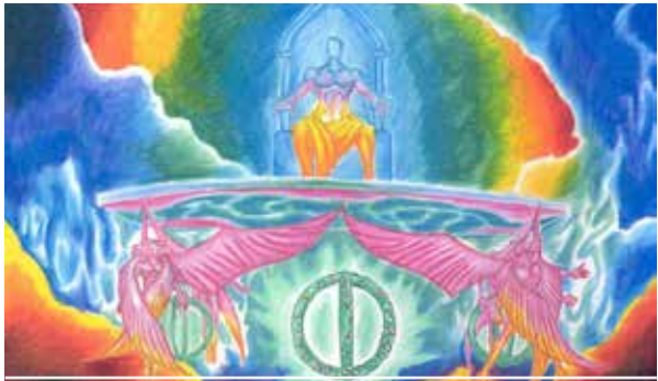
THE CONSTRAINT - V23