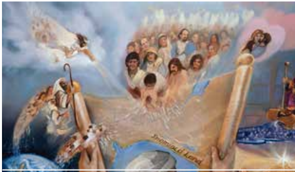
THE COMPASSION – V14-16