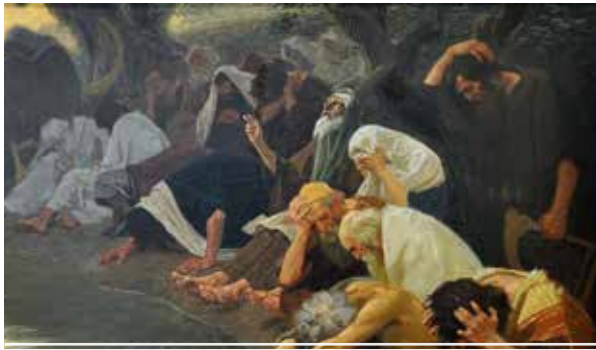
THE PRESERVED INHABITANTS – V14-21