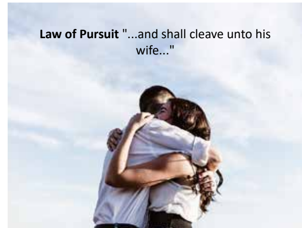
Law of Pursuit "...and shall cleave unto his wife..."