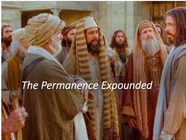
The Permanence Expounded