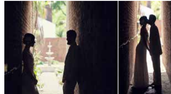
Law of Priority "Therefore shall a man leave his father and his mother..."