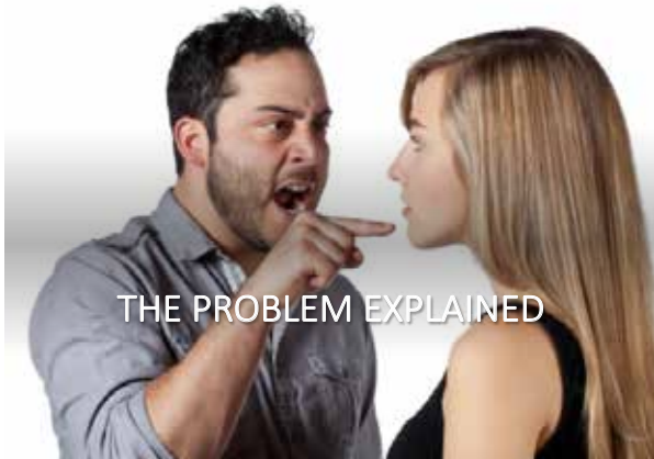
THE PROBLEM EXPLAINED