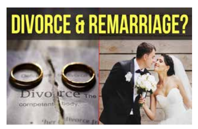
THE PROBLEM EXPOSED