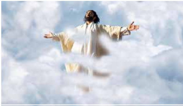
HIS APPEARING I will take away the chariots from Ephraim and the horses from Jerusalem.

HIS AUTHORITY The bows used in war will be broken. The king will talk to the nations about peace.