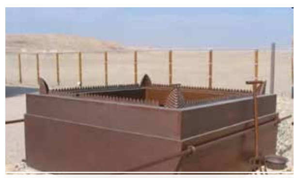
THE PURPOSE EXPLAINED