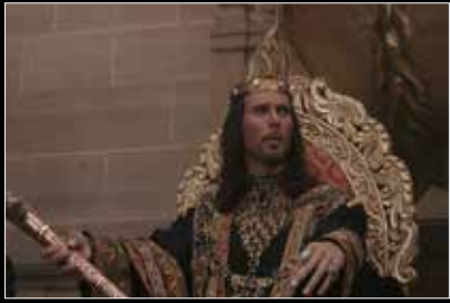
THE COMMAND EXERCISED - V10-12