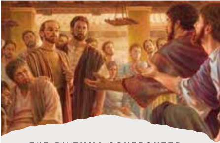
THE DILEMMA CONFRONTED - V22-23