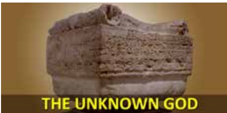
THE UNKNOWN GOD

You worship a god that you don't know, and this is the God I am telling you about!