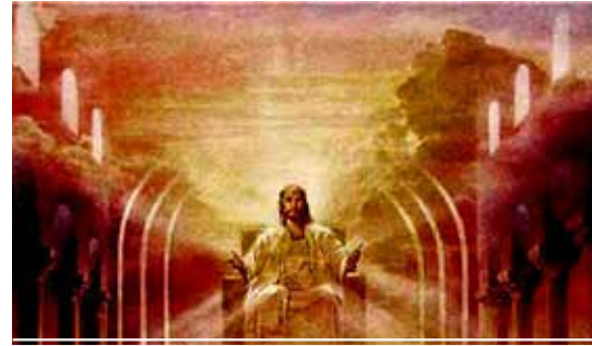
THE ASSIGNMENT – V2-3