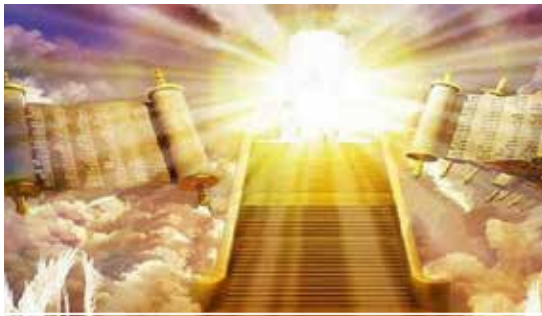
THE APPROACH – V1