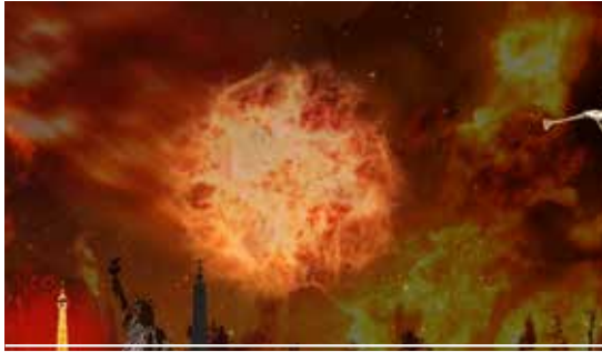
THE WOEFUL DISASTER – V1:8