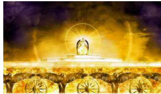
THE APPEARANCE – V4-5