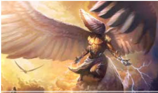
THE ACTIVITY - V6-8