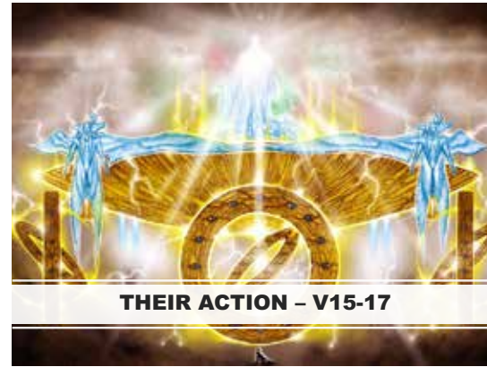
THEIR ACTION – V15-17