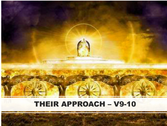
THEIR APPROACH – V9-10