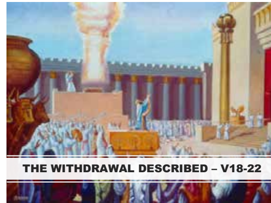
THE WITHDRAWAL DESCRIBED – V18-22