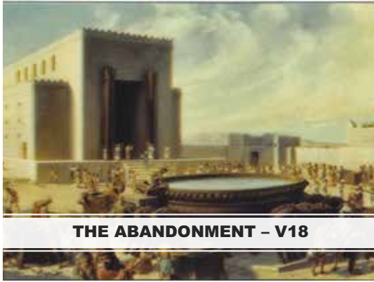
THE ABANDONMENT - V18