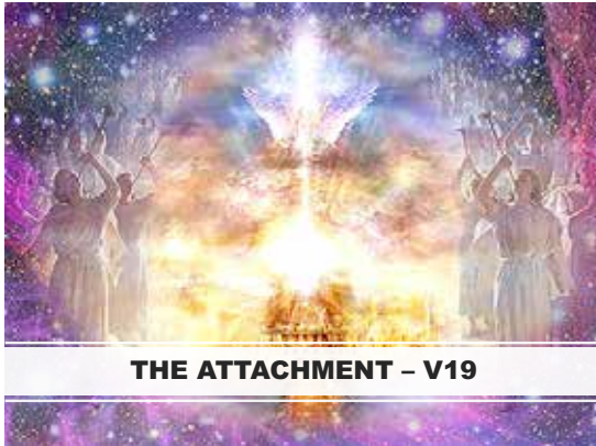
THE ATTACHMENT - V19