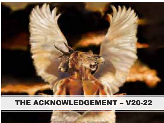
THE ACKNOWLEDGEMENT - V20-22