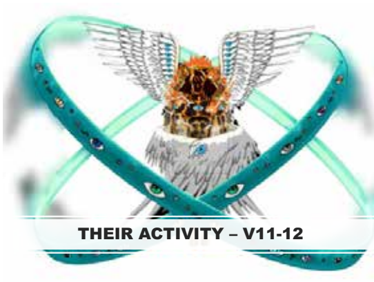
THEIR ACTIVITY – V11-12