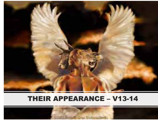
THEIR APPEARANCE – V13-14