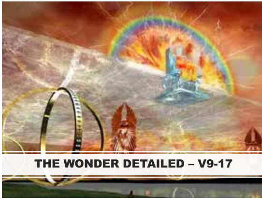
THE WONDER DETAILED – V9-17