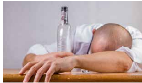
THE CONTROL - Does it control me, or do I control it?