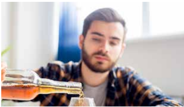
THE COMPULSION - Does it become a Habit?