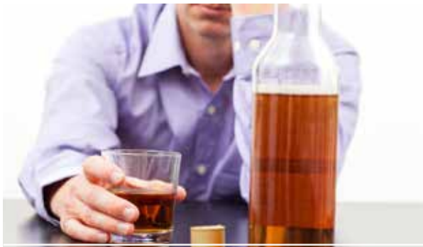
THE CHOICE - It is about Choice?