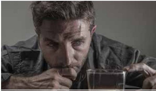
THE CONTENTION - Do I need it today?