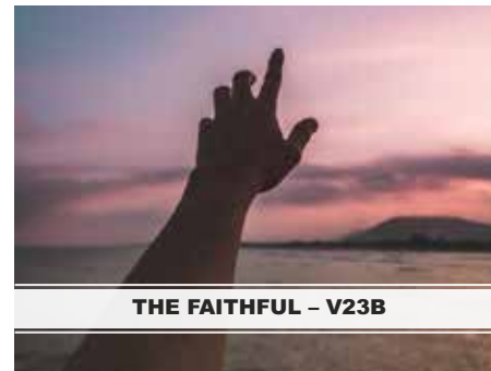
THE FAITHFUL - V23B