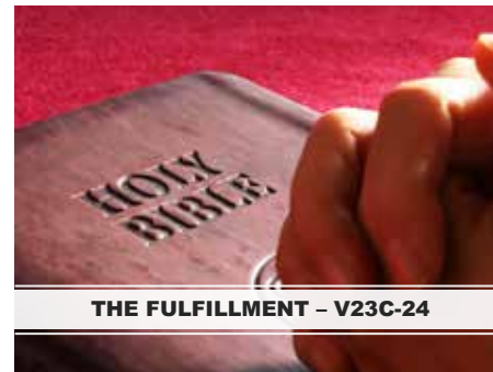
THE FULFILLMENT - V23C-24