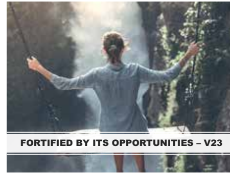
FORTIFIED BY ITS OPPORTUNITIES - V23