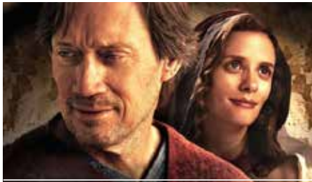
THE DILEMMA EXPOSED - V18-19

THE DETAILS - V18A This is how the birth of Jesus Christ came about. His mother Mary was engaged to marry Joseph,