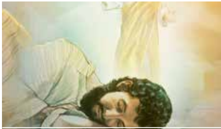
THE DECISION EXPRESSED - V24-25