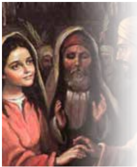
THE ACCEPTANCE - V24B

When Joseph woke up, he did what the Lord's angel had told him to do.