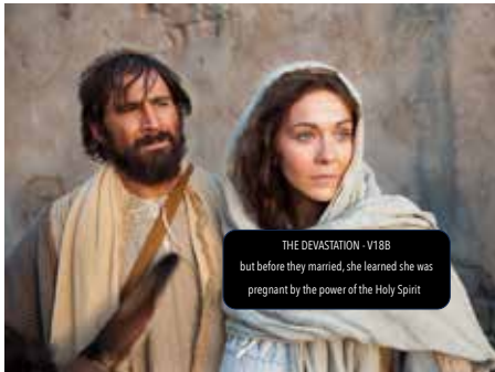
THE DEVASTATION - V18B but before they married, she learned she was pregnant by the power of the Holy Spirit