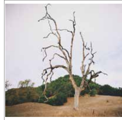
Fig trees may not grow figs, and there may be no grapes on the vines. There may be no olives growing and no food growing in the fields. There may be no sheep in the pens and no cattle in the barns.