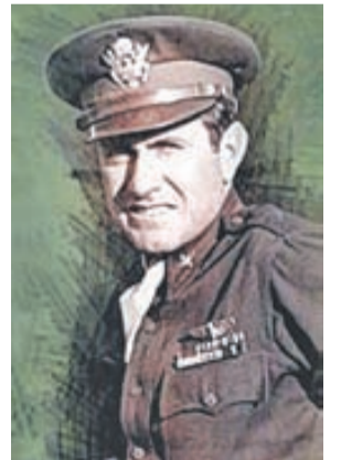
Louis Zamperini (1917 - 2014) in 'Captured by Grace'

You can view the free online documentary or purchase a DVD at billygraham.org .