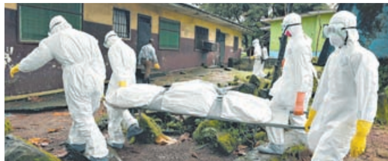
Half of the deaths in the latest outbreak are in Liberia, like this one in the capital Monrovia

But what use could viruses have in a perfect world, since they must hijack a living creature's reproductive machinery? Some clues to possible benign pre-Fall roles for viruses can be gleaned from functions they have even today. Viruses have a number of useful functions even now, including transporting genes among plants and