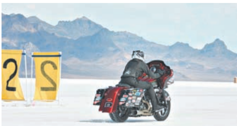
Heading for 195mph (314kph) on the Bonneville Salt Flats in Utah

"I don't have to have all the strength or all the answers. I can lean on God when I feel like I'm facing something that I just can't do," she concludes. "I don't have to feel alone anymore. He is always there." ●