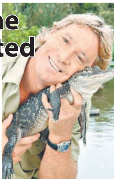
The late "Crocodile Hunter" Steve Irwin

You could wait to find answers later but you may run out of time. Like many others, I am sure Phil Hughes started his day thinking it would be like any other; sadly it was not.