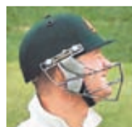
Michael Clarke grimaces in pain