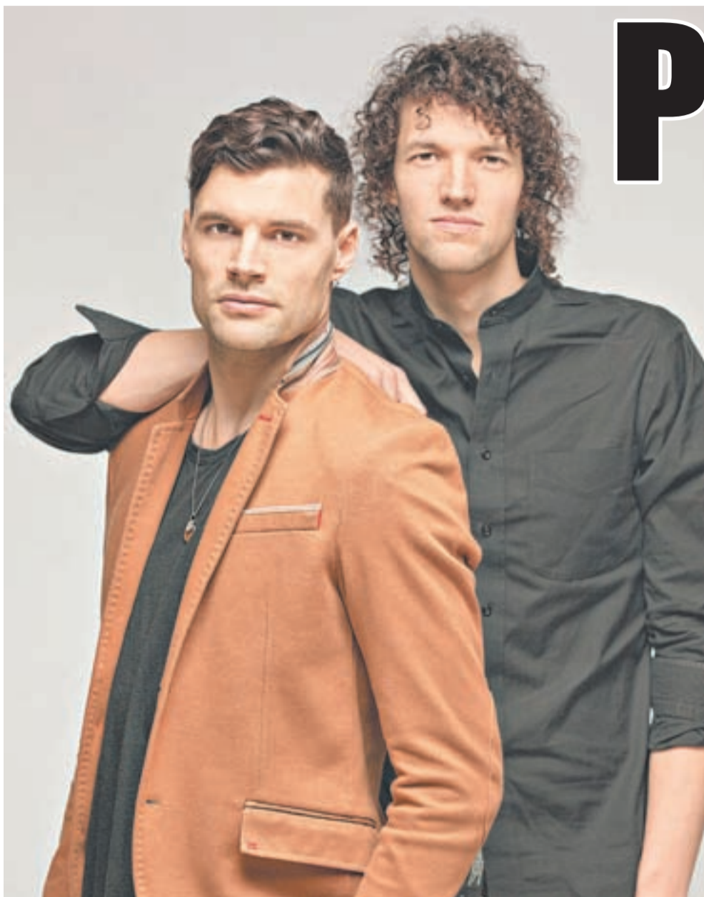
Brothers Joel and Luke Smallbone want women to know they are priceless