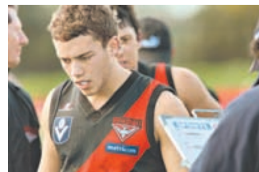
Ash playing with Essendon's Reserves

"If you choose to let Him in, you will have the most amazing life available to you!"