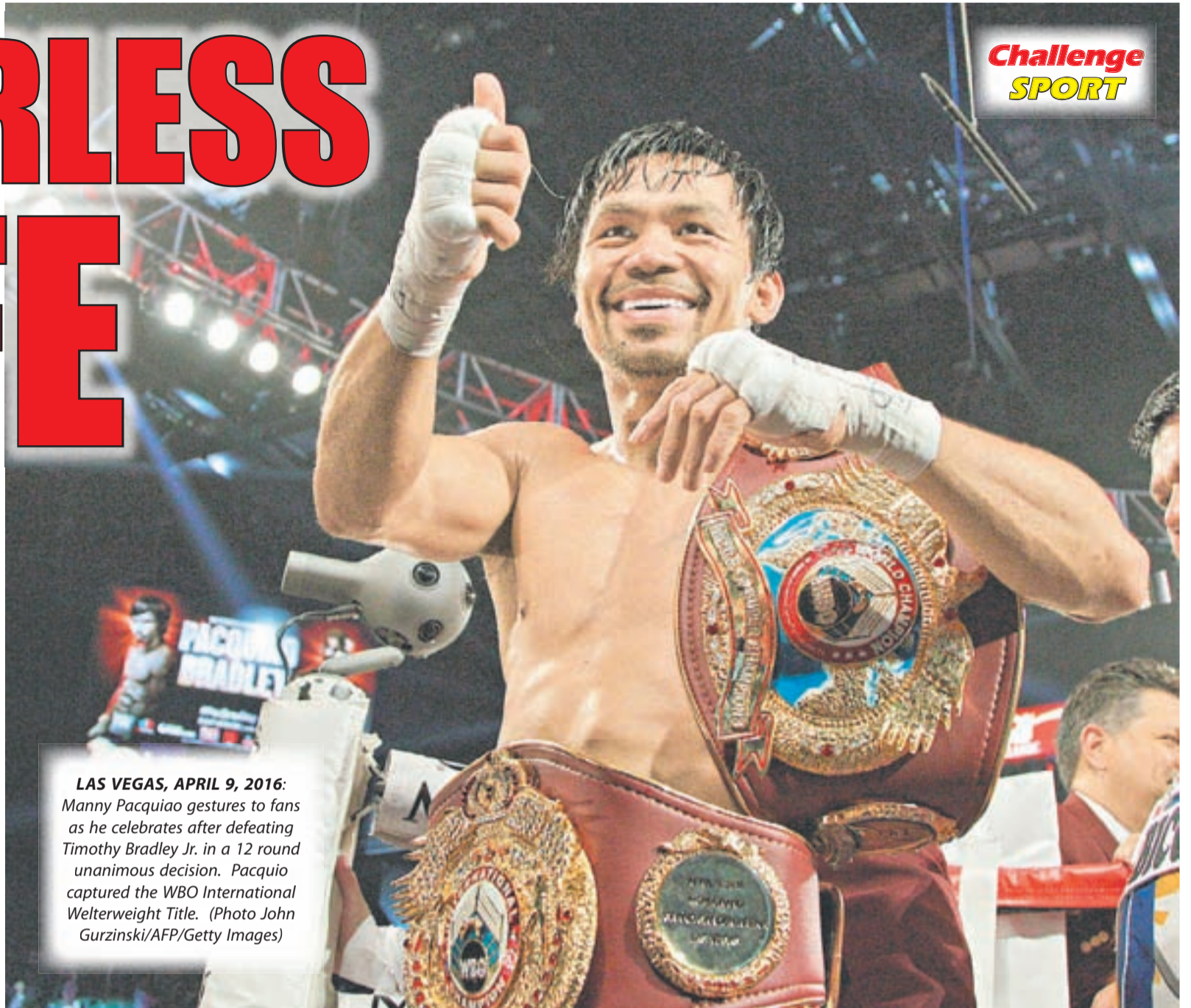
LAS VEGAS, APRIL 9, 2016: Manny Pacquiao gestures to fans as he celebrates after defeating Timothy Bradley Jr. in a 12 round unanimous decision. Pacquiao captured the WBO International Welterweight Title.

Manny has used his status as the world's second highest paid athlete of 2015 (according to Forbes), to be one of his sport's most generous people, as illustrated when he gave away $80 million, half of his Mayweather